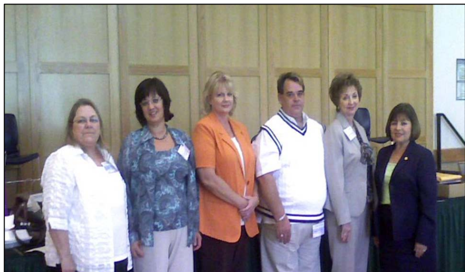
2007-2008 Lone Star Officers